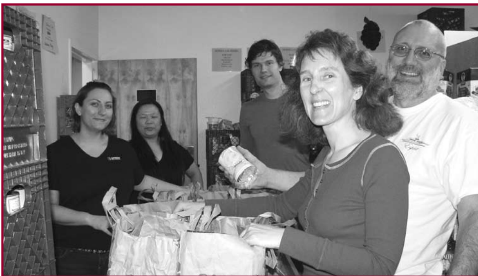
Raybeam volunteers helping out in the Holiday Sharing Program.